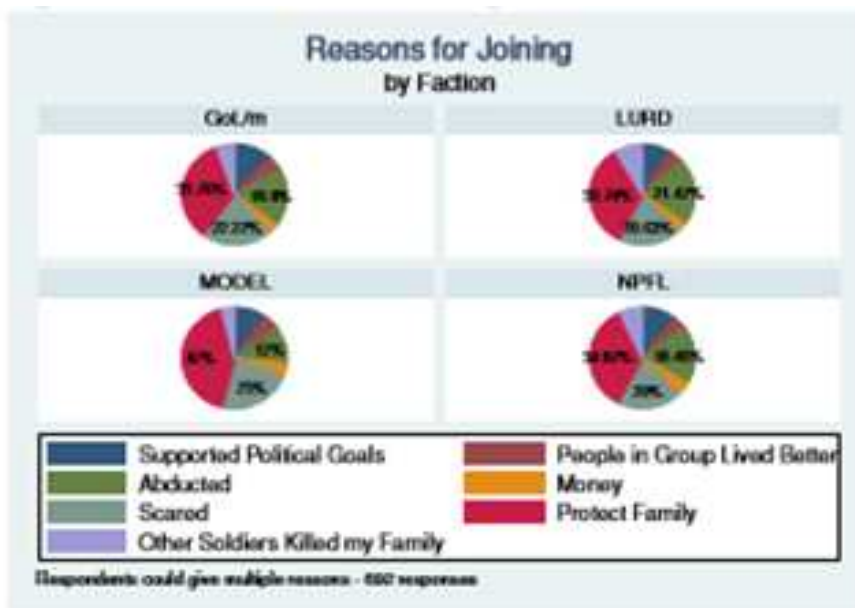
Graph n° 2: Reasons for joining